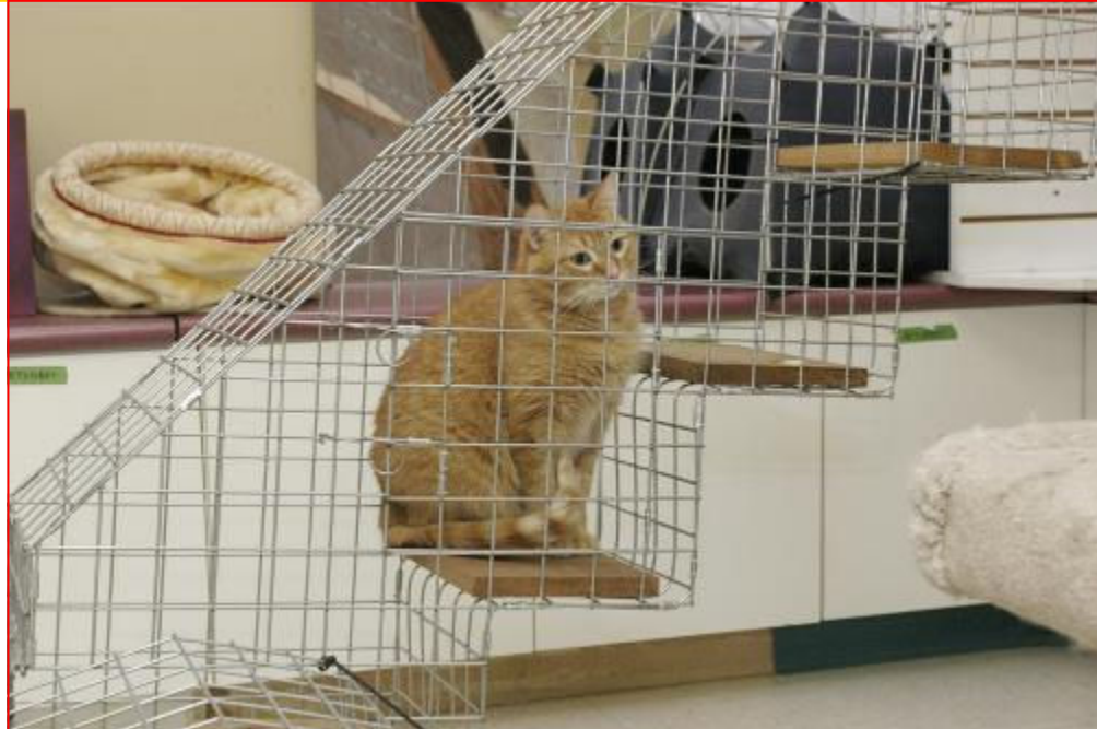
These pictures are of The Cat Den that is on display at the SCAT Street Cat Rescue location on Faithfull Ave/51st Street.