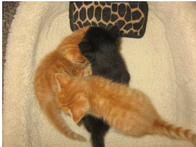
These cute kittens are just three of many waiting for their forever homes