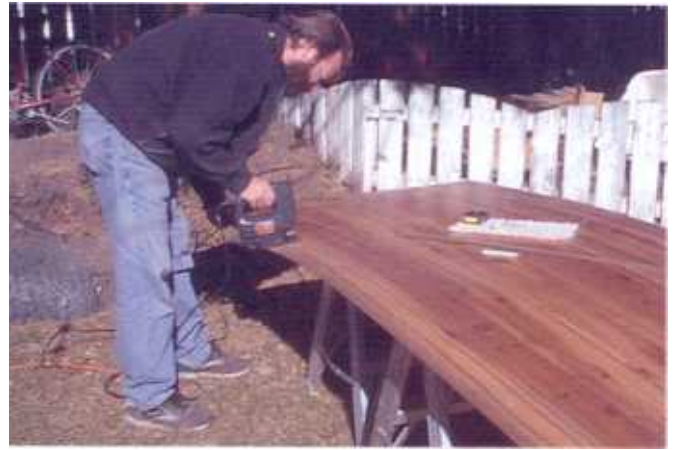
Cut panelling to fit